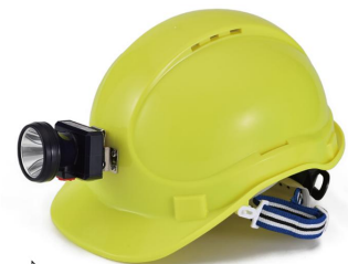
Available with LED Light