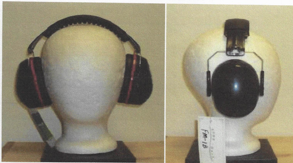
Test Item: Q5994A

These data were obtained through measurements made at the laboratories of Michael & Associates, Inc., State College, PA , USA. Michael & Associates, Inc., is accredited to test to ANSI S3.19-1974, ANSI S12.6-2016, ANSI S12.42-2010, EN352 parts 1-8 and AS/NZ S1270:2002 by the National Institute of Standards and Technology (NIST) National Voluntary Laboratory Accreditation Program (NVLAP).